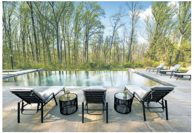
This 173-year-old converted bank barn in Media, Pennsylvania, has been uniquely redesigned with a focus on marrying old charm with a modern style (left). Just two miles from Route 30 in Berwyn, Pennsylvania, this private oasis set on 1.4 acres isn't just a home, it's a lifestyle (right).