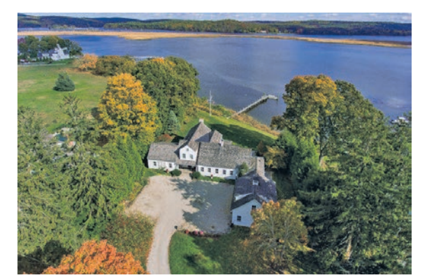
37 Woodbine Avenue, Larchmont, NY Historically Significant Gem in Larchmont Manor $5,500,000 | 7 Beds | 6/2 Baths | 6,842 SF Casey Rosenblum & Courtney Walker | 37woodbineavenue.com