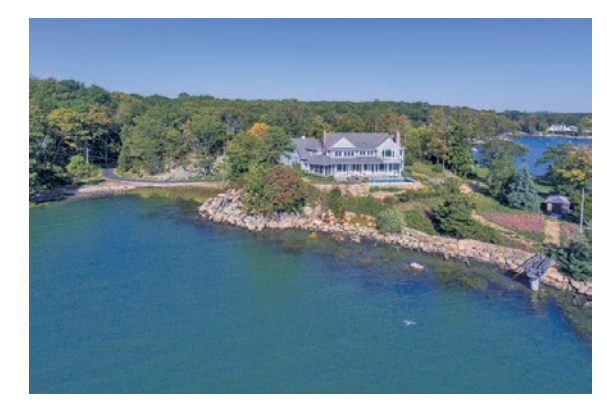
270 Old Quarry Road, Guilford, CT Waterfront Vistas, Privacy, Beautiful Sunrises & Sunsets $5,450,000| 4 Beds | 5/2 Baths | 6,267 SF Doug Werner & Rick Weiner | 270oldquarryroad.com