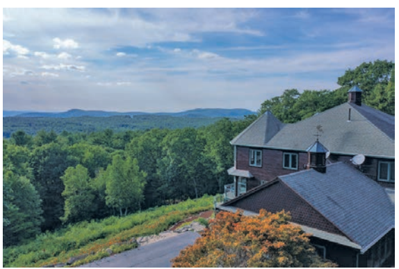
34 Sumner Mountain Rd, Shutesbury, MA Big Sky Views in the 5 College Area Near Amherst, MA $1,395,000 | 5 Beds | 4 Baths | 4,542 SF Jeff Loholdt & George Cain | 34sumnermountainrd.com