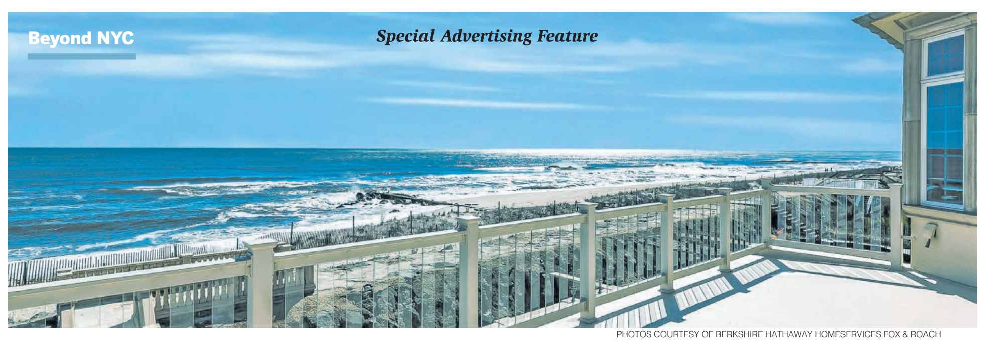
Enjoy unimpeded views of the ocean and bay from the rooftop deck at 7 Tradewinds Lane (above). These extraordinary oceanfront homes are just an hour from New York City (below).