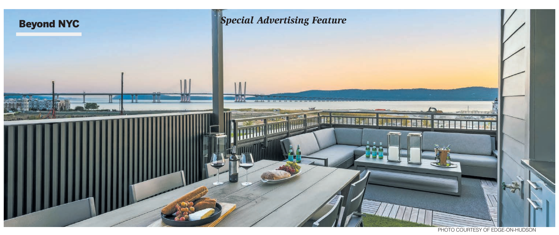
Walking distance from two Metro-North rail stations and only a 38-minute train ride from Grand Central Station, commuters can bike, hike or relax on their townhome rooftop in Edge-on-Hudson in Sleepy Hollow.